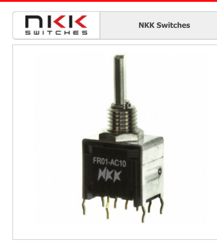
Image may be representation. See specifications for product details.