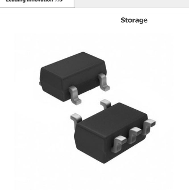
Image may be representation. See specifications for product details.