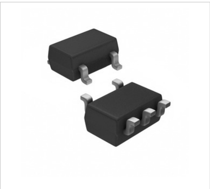
Image may be representation. See specifications for product details.