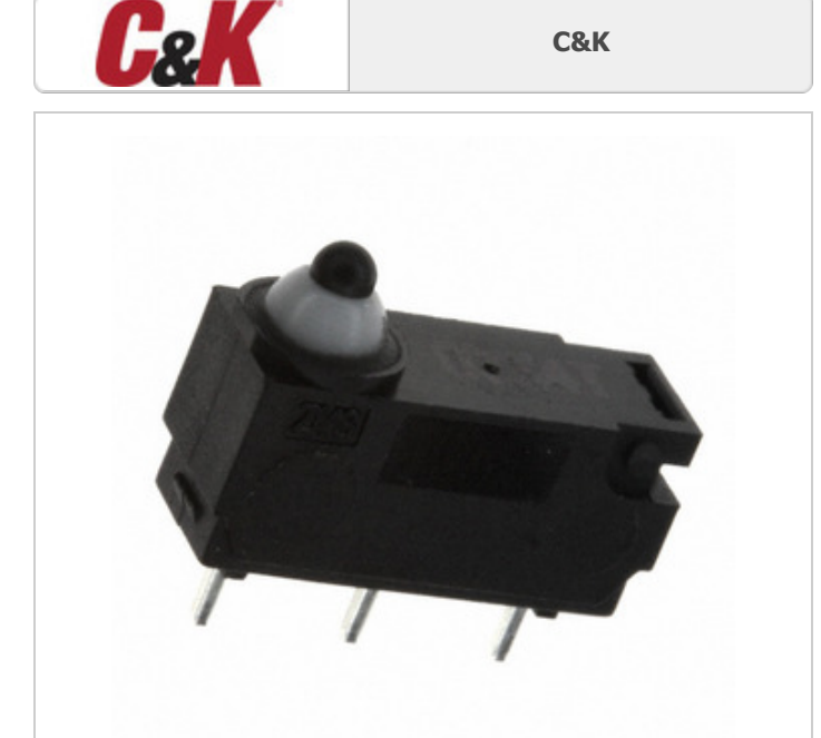
Image may be representation. See specifications for product details.