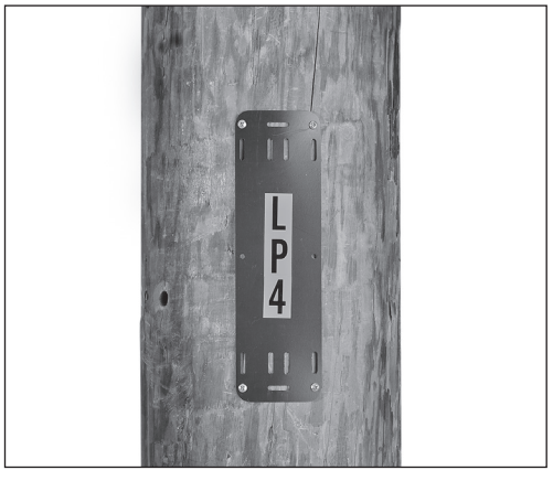
Figure 2 Use outer holes and nails for mounting on poles.

3M and Scotch-brite are trademarks of 3M Company.