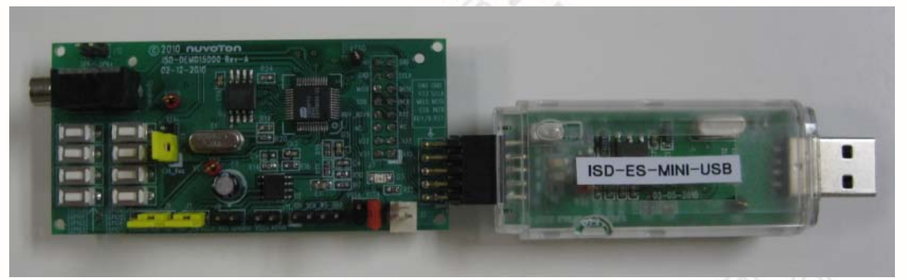
Figure 3 – ISD_DEMO15D00 connected with ISD-ES_MINI_USB (dongle) board