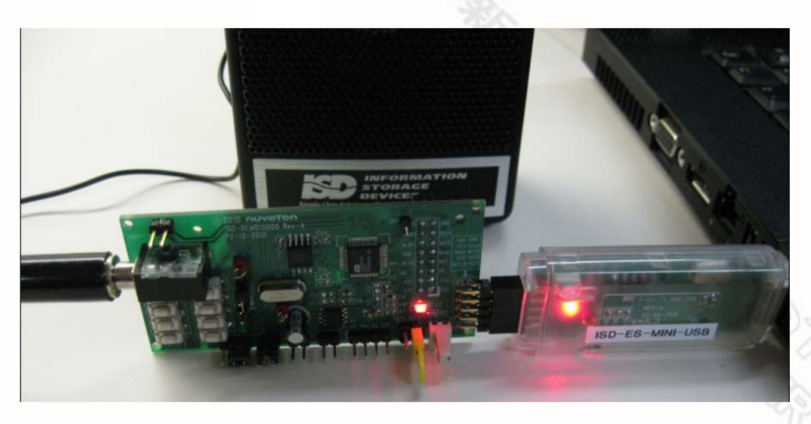
Figure 4 – A complete evaluation environment for ISD15D00 device