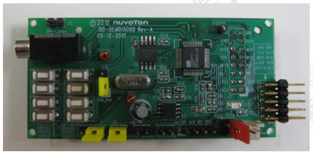
Figure 1 – Top view of ISD-DEMO15D00 Rev-A board