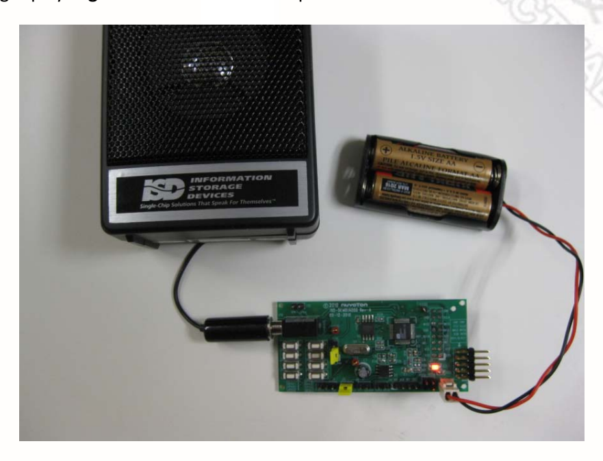
Figure 8 – ISD15D00 demo board standalone evaluation.

There are 8 push buttons on ISD-DEMO15D00 board which allow user to evaluate the ISD15D00 feature of trigger play. Figure 8 below show thes operation environment.