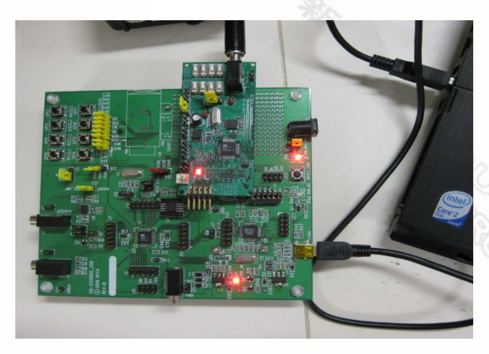
Figure 6 - ISD15D00 is connected onto ISD-ES15D00_USB mother board

J8: two-pin connector for speaker. This is the output from audio amplifier ISD8101.