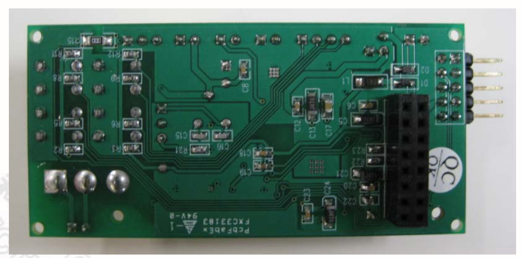
Figure 2 – Bottom view of ISD-DEMO15D00 Rev-A board