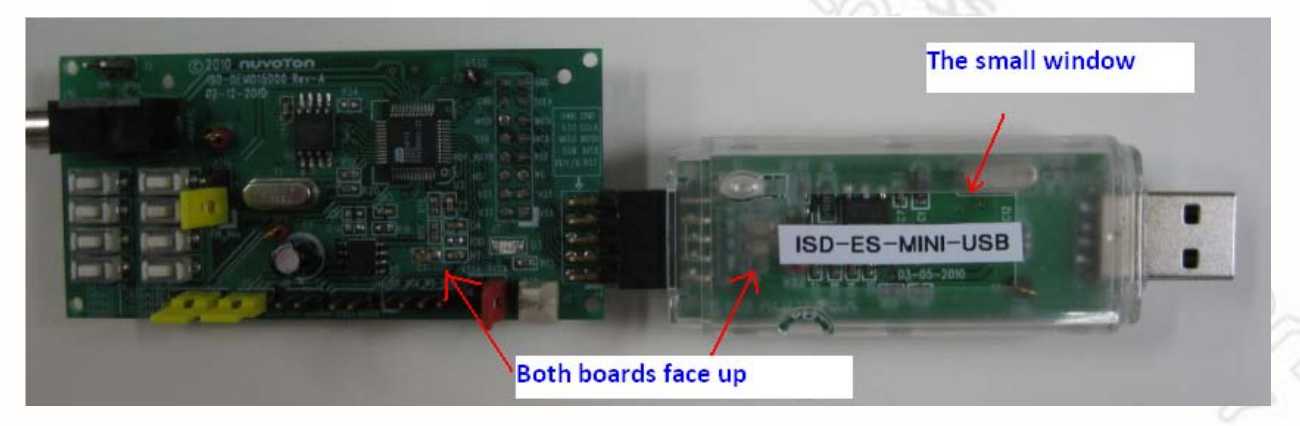
Figure 5 – connect ISD15D00 demo board with the USB dongle.

Please note: It could cause hardware damage if the two boards are not connected correctly.