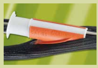
Wrappable Sleeving Tool This tool simplifies applying our GRP-130 and GRP-130NF sleeves.

Alpha heat guns are the perfect complement to FIT tubing, making it easy to apply the tubing quickly and efficiently.