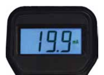
MOMENTARY BACKLIGHT ON