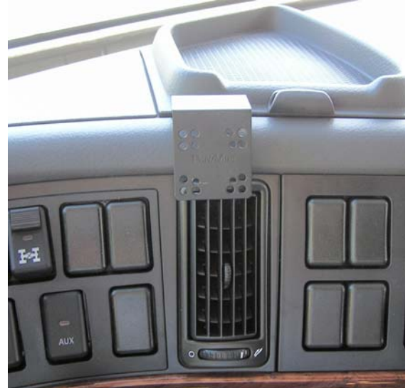
InDash installed showing South direction