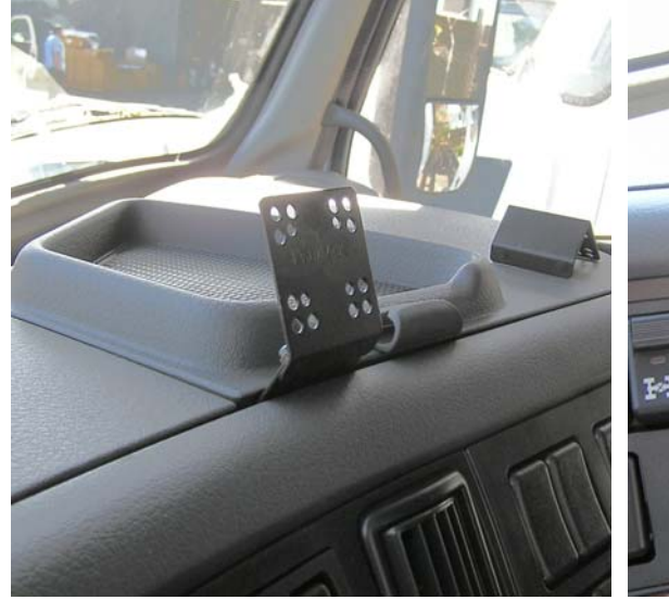
InDash installed showing North direction