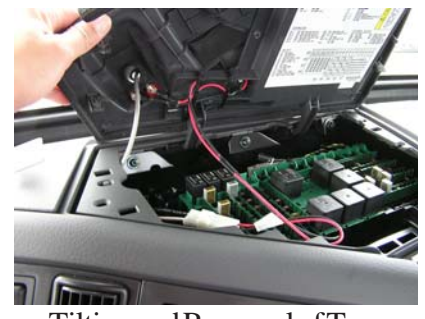
Tilting and Removal of Top