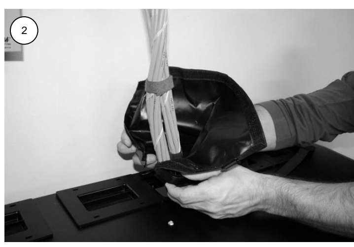
Step 2: Place the fitting around the cable bundle.