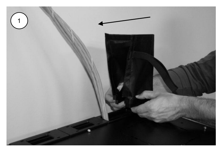
Step 1: Disengage the hook and loop cinch tie and the hook and loop strips along the top edge and side of the fabric sleeve. Open the fitting to accept the existing cable bundle by separating the end of the fitting assembly.