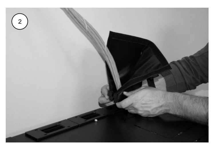
Step 2: Place the fitting around the cable bundle.