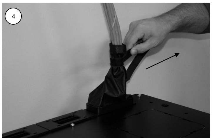
Step 4: Reattach the hook and loop at the top edge of the fabric sleeve. Pull the hook and loop cinch tie tight around the cable bundle. Wrap cinch tie around the cable bundle and attach it to itself. If applicable, trim off the excess cinch tie material.