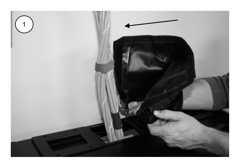
Step 1: Disengage the hook and loop cinch tie and the hook and loop strips along the top edge and side of the fabric sleeve. Open the fitting to accept the existing cable bundle by separating the end of the fitting assembly.