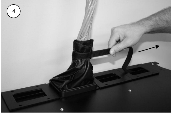
Step 4: Reattach the hook and loop at the top edge of the fabric sleeve. Pull the hook and loop cinch tie tight around the cable bundle. Wrap cinch tie around the cable bundle and attach it to itself. If applicable, trim off the excess cinch tie material.

For Instructions in Local Languages and Technical Support: