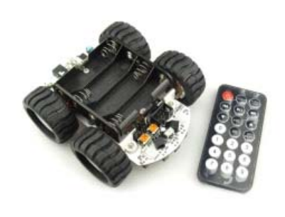
4WD MiniQ Complete Kit V1 (SKU:ROB0050)