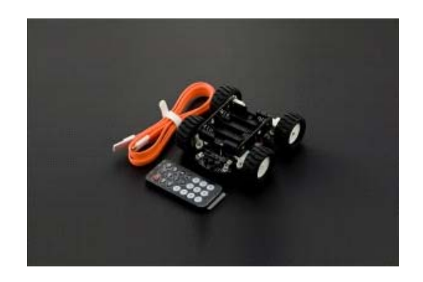
4WD MiniQ Complete Kit V2 (SKU:ROB0050)