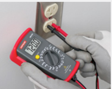
\begin{tabular}{ll} \textbf{Accurately measure} & voltage up to 250 V in receptacles, switches, extension cords and light fixtures \\ \end{tabular}