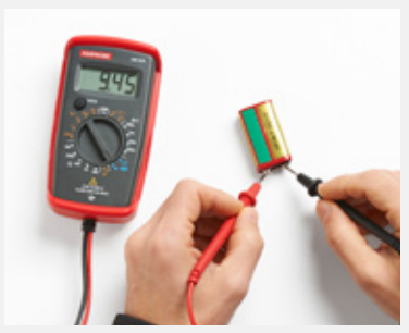
Check 1.5 V and 9 V batteries

How to measure voltage: Select 250 V~ on the dial. Insert the black and red test leads into receptacle or end of extension cord. It doesn't matter which lead goes into hot or neutral. The LCD screen will show voltage level. Voltage level should be in the range of 110-120 V for most house receptacles. Some appliances, such as dryers and stoves, may operate with higher voltage and will have special receptacles. The meter will show 220-240 V in this case.