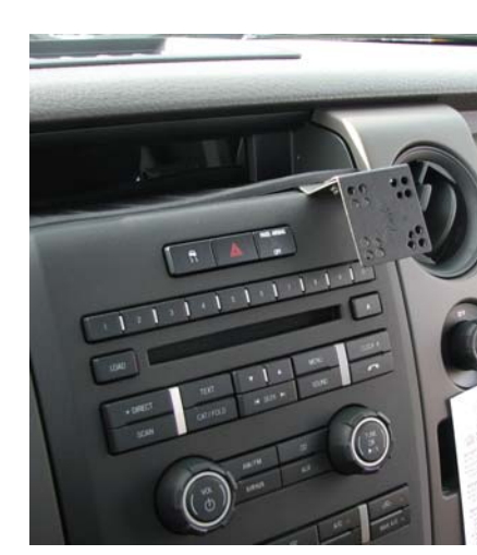
Mount in Place with Mounting Plate in Right Side Down Position