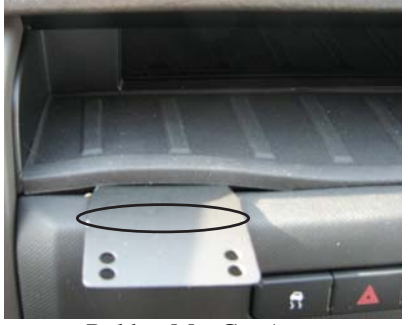
Rubber Mat Cut Area