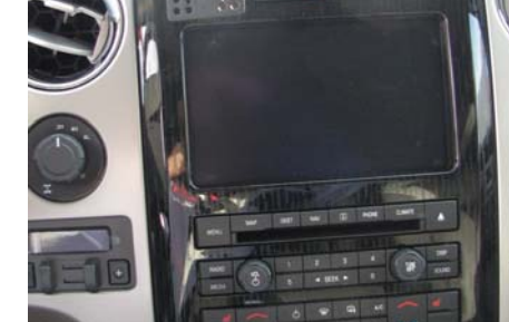
Mount in Place with Mounting Plate in Left Side Down Position on Nav.