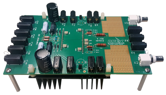
Assembled EK37 evaluation kit for MP104.

The MP104 is a unique product design using an open frame package form factor. The compact package frame has 42 external pin connects. The open frame concept utilizes a copper circuit layer and isolated metal substrate (IMS) to provide exceptional thermal properties. The evaluation kit for the MP104 is the EK37 which comes with all necessary hardware, including a heatsink. Evaluation units of the MP104 can be purchased separately.