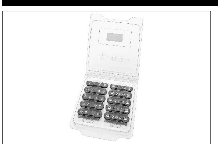
Figure 15–1 — SurfMates; Five pair sets

Table 15-2 — Material properties of SurfMate components