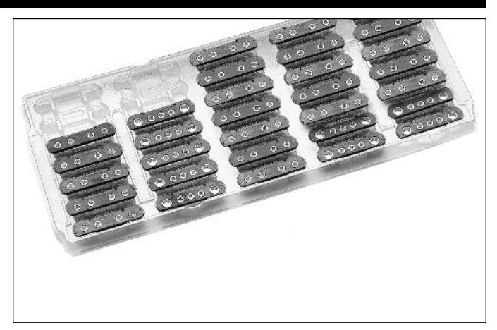
Figure 15–2 — SurfMates; Individual part numbers