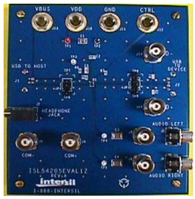
FIGURE 1. ISL54205BEVAL1Z EVALUATION BOARD (TOP VIEW)