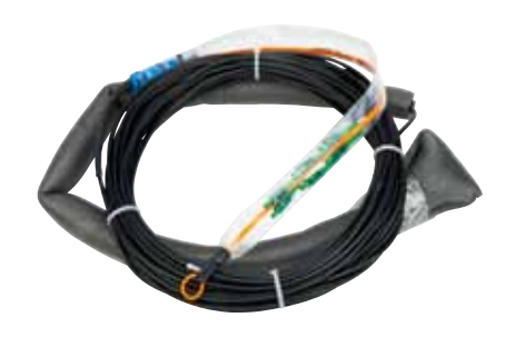
3M<sup>™</sup> External Cable Assembly Module (ECAM) Factory Terminated Fiber Cable Assembly (FCA)