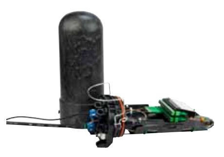
3M™ Fiber Dome Stubbed Terminal FDST 08S

The FDST 08S terminal features a fixed O-ring sealing system along with an innovative latching mechanism. This combination provides simple, virtually error-free terminal sealing and re-entry. Also, the re-entry feature allows easy access to clean and repair connectors and replace the terminal or terminal tail in the event that either of these are damaged.