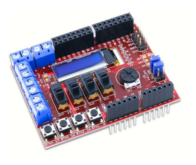
The chipKIT Basic I/O Shield.

The Basic I/O Shield has the same form factor as the Uno32 board, but is also useable with the Max32 board.