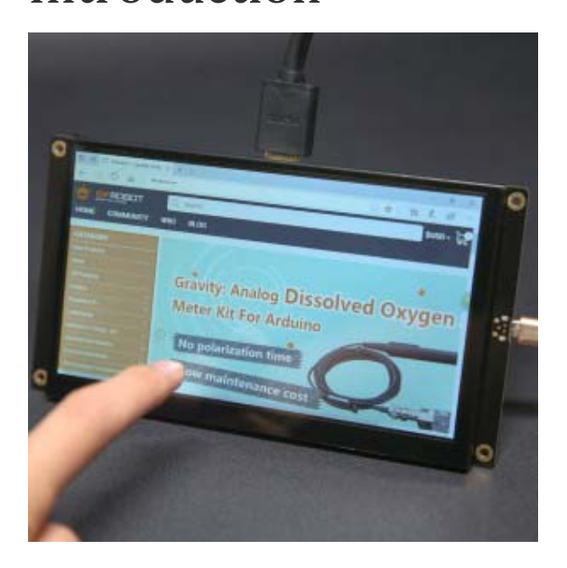
7 HDMI Display with Capacitive Touchscreen

This is a 7 HDMI display with capacitive touchscreen. It comes with a 7" LCD screen with capacitive touch panel overlay on it. The touch panel supports up to 5 touch points. And it adopts DFRobot USB free-driver technology, no special requirement of drivers. You can use it as easy as keyboard or mouse. It can be directly plugged to PC for touching control. In combination with HDMI HD screen, it can turn a large PC to a tablet immediately.