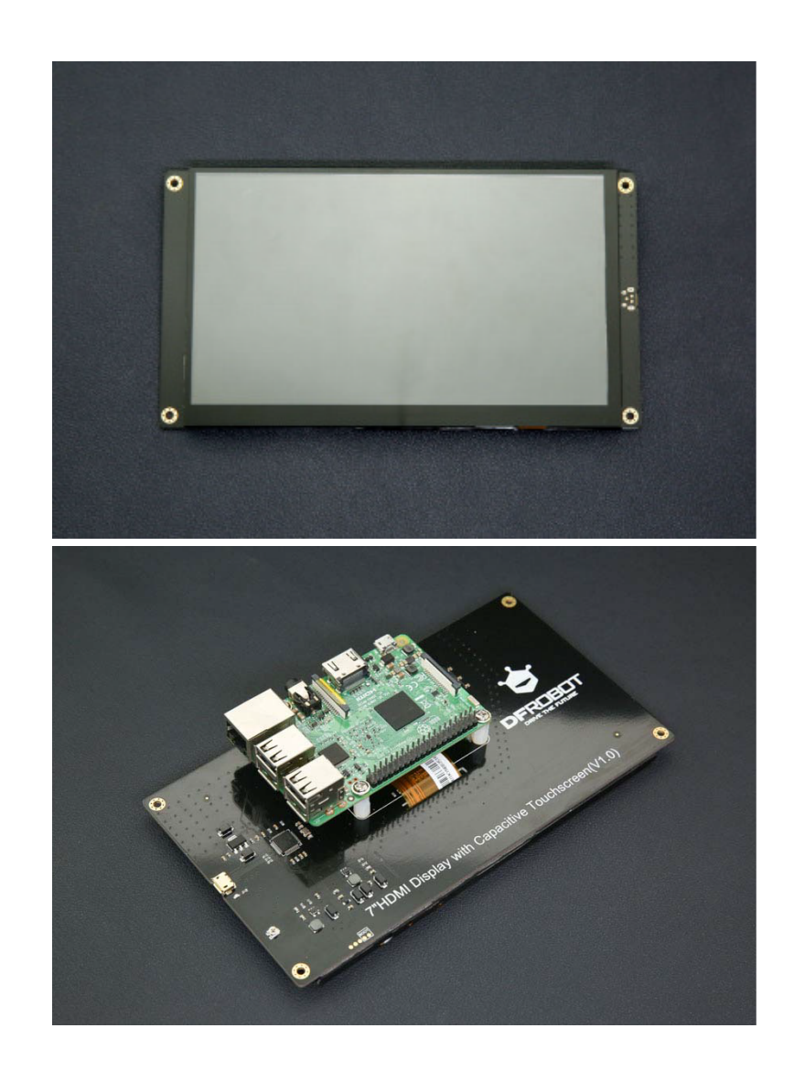
7" HDMI Display with Capacitive Touchscreen SKU: DFR0506