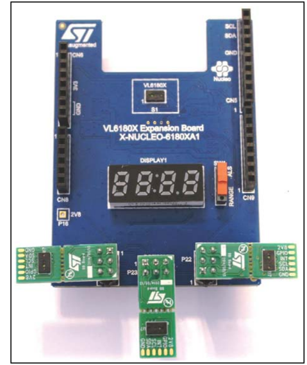
Figure 2. Connections of VL6180X satellite boards

Note: VL6180X satellite boards can be ordered under the reference: VL6180X-SATEL.