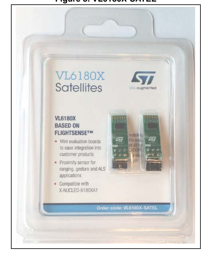
Figure 3. VL6180X-SATEL

Note: VL6180X satellite boards can be ordered under the reference: VL6180X-SATEL.