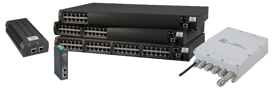
Figure 1: Microsemi PoE solutions include single and multi port midspans, hubs, switches, and accessories for indoor and outdoor activities