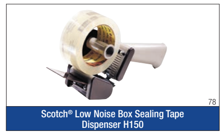
A hand-held, roll-on, pistol-grip dispenser designed to reduce the noise of tape unwind.