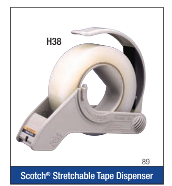
Hand-held dispenser with tensioning/ stretching brake for use with 3M™ Stretchable Tapes.