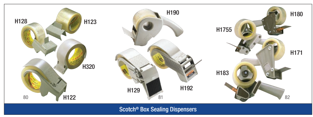
Hand-held dispensers for use with specially formulated Scotch® Box Sealing Tapes.