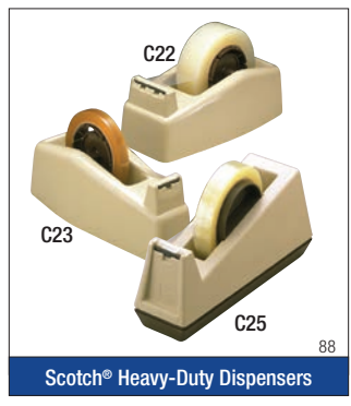
Manual heavy-duty dispensers for use with 3M™ Narrow Width Film Tapes.