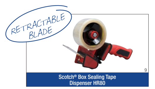
Portable, lightweight, easy to operate, hand-held dispenser with a retractable blade.