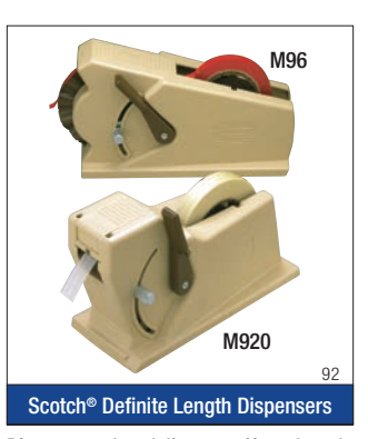
Dispensers that deliver a uniform length of 3M™ Narrow Width Tape and Scotch® Filament Tapes every time quickly and