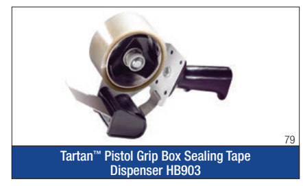
A hand-held, roll-on, pistol-grip dispenser.