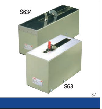
Semi-automatic dispensers for use with Scotch® High Strength Filament Tapes.