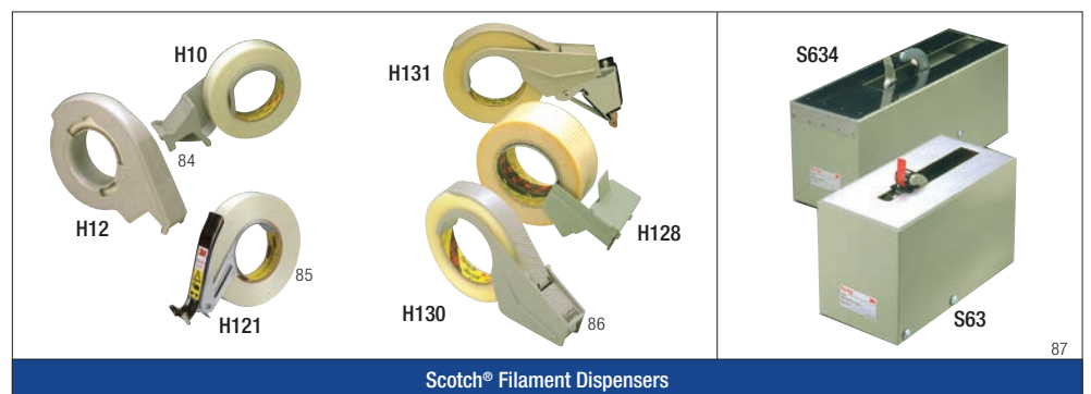
Hand-held dispensers for use with Scotch® High Strength Filament Tapes.