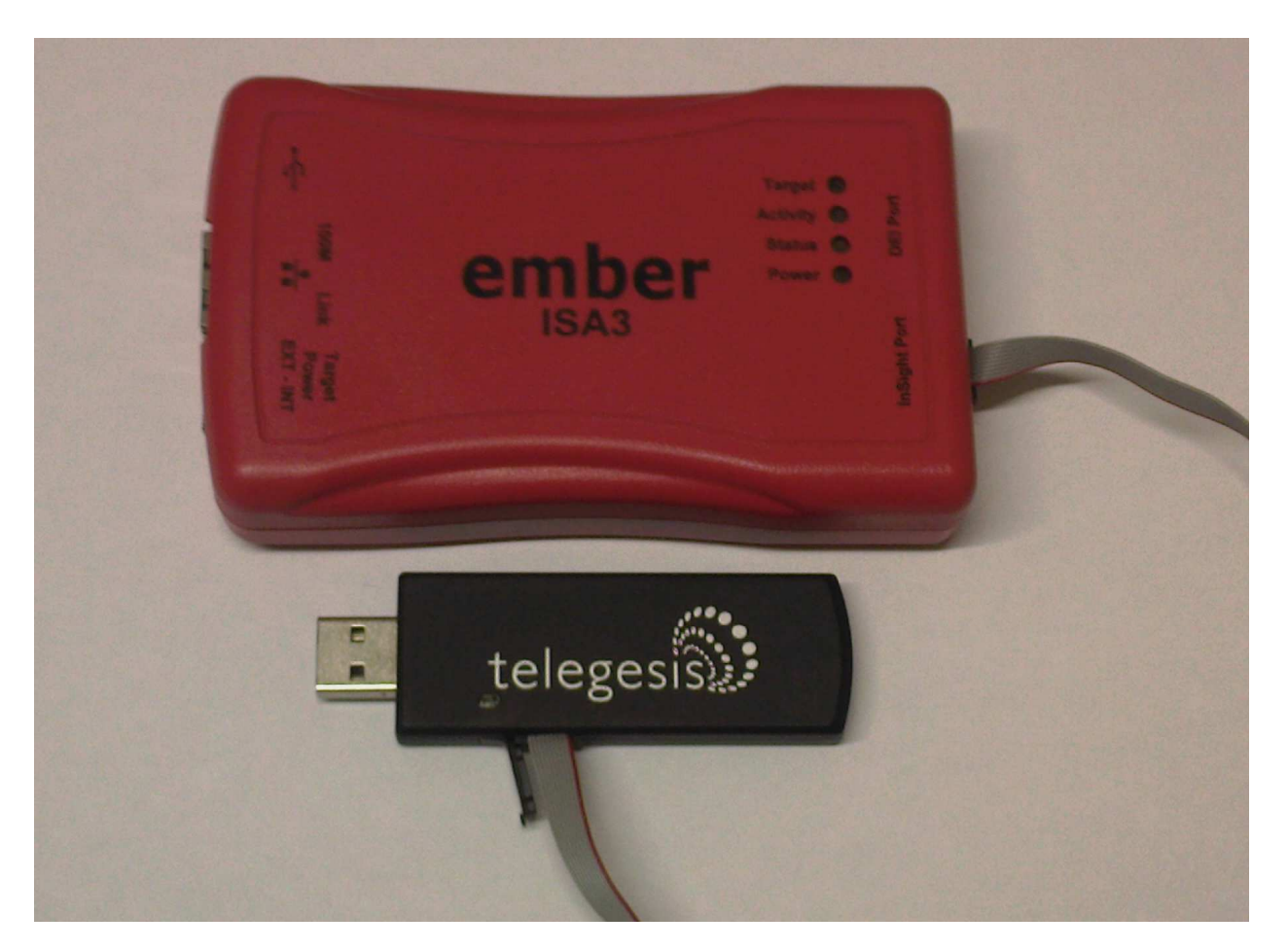
Figure 4: Connecting the ETRX357USB to the Ember ISA3

In order to download custom firmware onto the ETRX357, the Ember bootloader can be used or alternatively the ETRX357USB can be directly connected to the Ember InSight Adapter3 for programming and real time debugging.