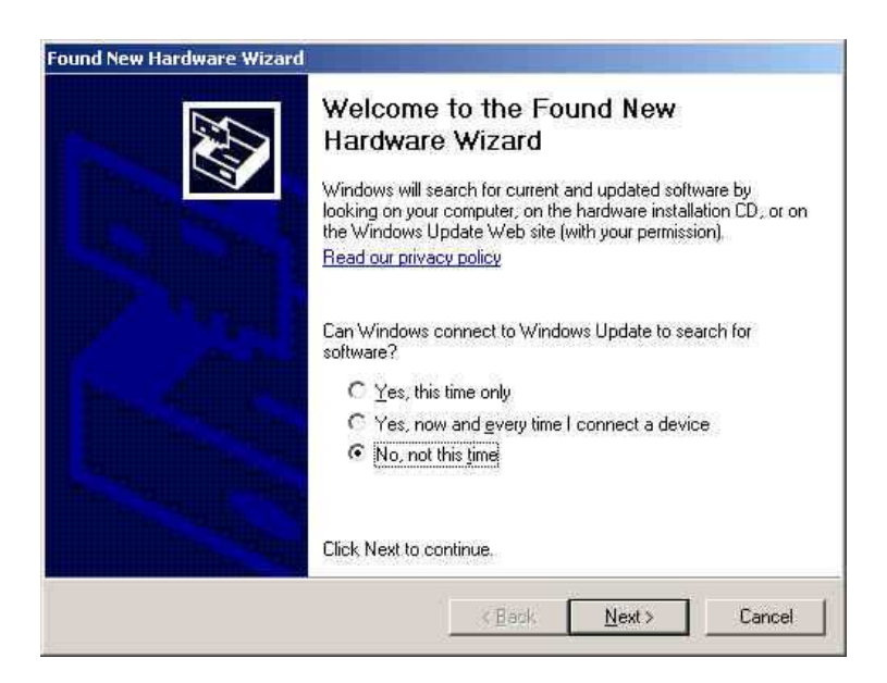
Figure 1: Found New Hardware Wizard

The driver package downloadable from the Support → Software download page of <a href="https://www.telegesis.com">www.telegesis.com</a> should be unzipped into a local folder. When executing the file 'TgVCPInstaller.exe' prior to plugging in the ETRX357USB stick an installer will guide you through the steps required for the driver installation.