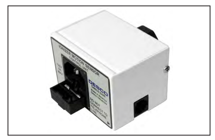
Figure 6. Replacing the fuse in the Control Unit

The fuse located in the Control Unit may be replaced by removing the power cord and opening the fuse drawer at the IEC inlet. The Control Unit uses one 5A, 250V slow blow fuse. DO NOT use other ratings as it may pose a safety hazard.