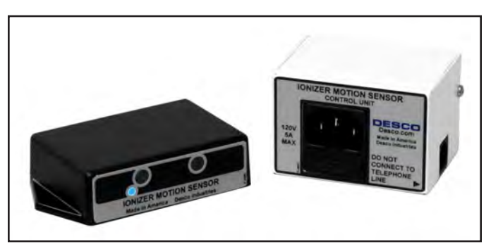
Figure 1. Desco 60509 Ionizer Motion Sensor