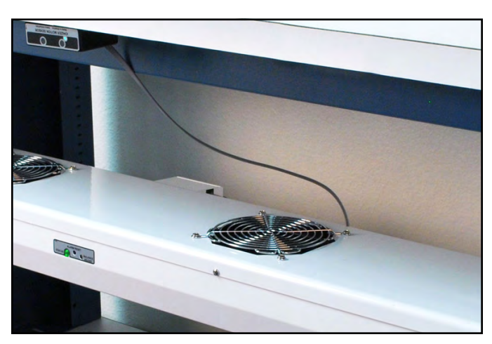
Figure 5. Using the Ionizer Motion Sensor with the 60473 Chargebuster® 3-Fan Overhead Ionizer

DESCO WEST - 3651 Walnut Avenue, Chino, CA 91710 • (909) 627-8178 DESCO EAST - One Colgate Way, Canton, MA 02021-1407 • (781) 821-8370 • Website: Desco.com