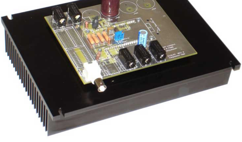
Figure 3: Assembly